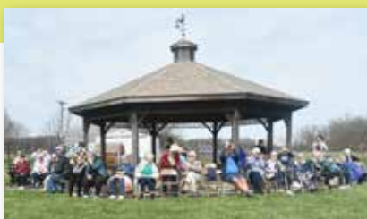
Eclipse watchers gathered at the gazebo, near St. Mary Organic Farm.

Sisters and guests gathered outside near St. Mary Organic Farm to experience the once-in-a-lifetime solar eclipse!