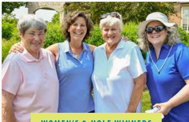
WOMEN'S 9-HOLE WINNERS