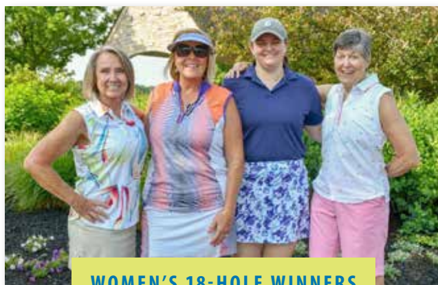
WOMEN'S 18-HOLE WINNERS