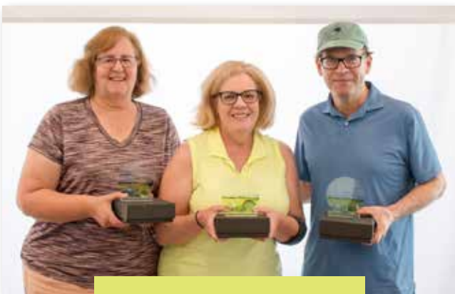
MIXED 9-HOLE WINNERS