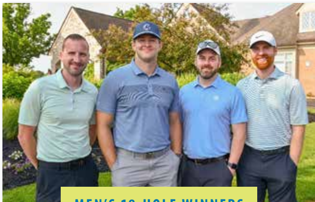
MEN'S 18-HOLE WINNERS