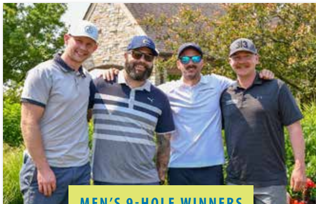
MEN'S 9-HOLE WINNERS