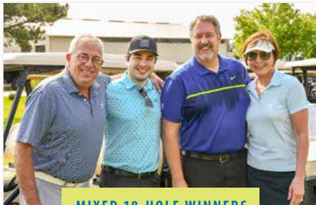
MIXED 18-HOLE WINNERS

Together, we raised $95,208 in support of IHM ministries.