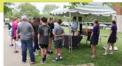
A group of students listens intently to a presenter during the Water Festival.

The River Raisin Institute, a nonprofit founded by IHM Sisters to offer educational programming on sustainability, hosted its annual Water Festival. Hundreds of Monroe County students spent the day engaged in activities, enjoying beautiful weather. The students attended presentations by environmental experts who taught topics like water science, pollution prevention and sustainability, all while exploring the award-winning green campus, which served as a living laboratory.