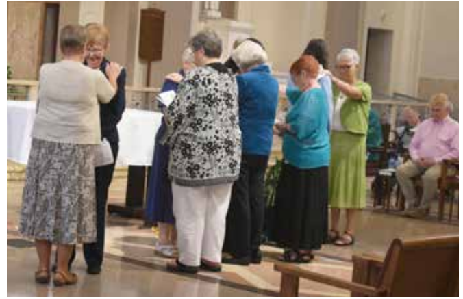
The former leadership council extends blessings to the new leadership team.