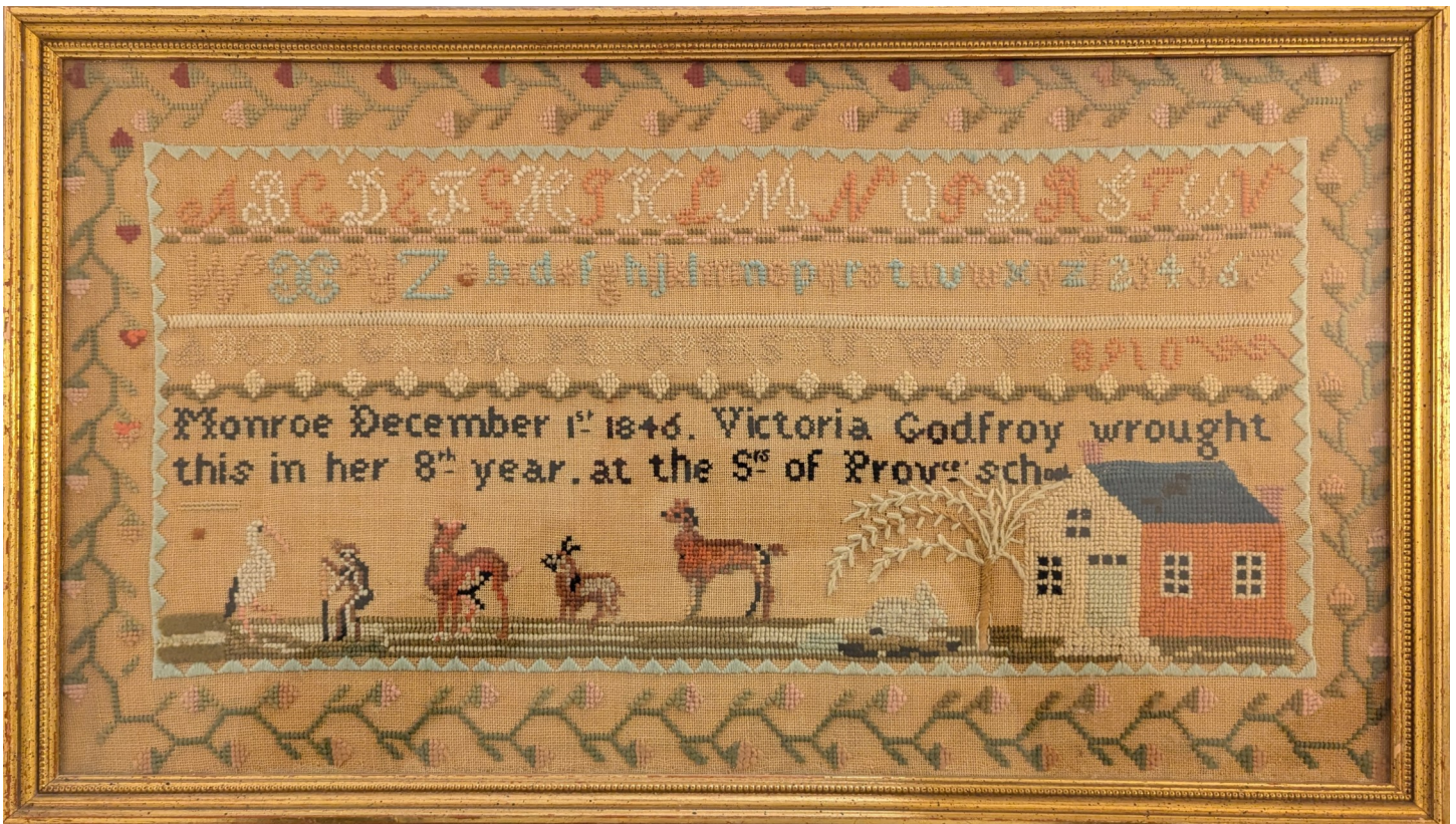
The 11x21-inch sampler shows Victoria's handiwork in animals, flowers, the alphabet and a structure.