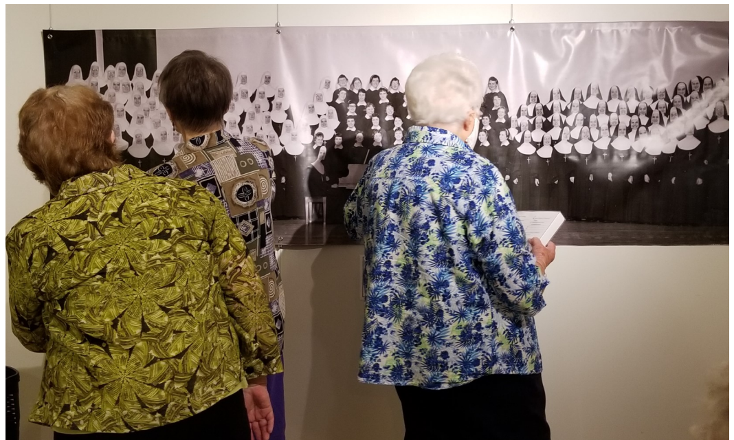
Sisters examine a 1961 photo during the exhibit's opening reception July 20.

This time the photo is enlarged into an eight-