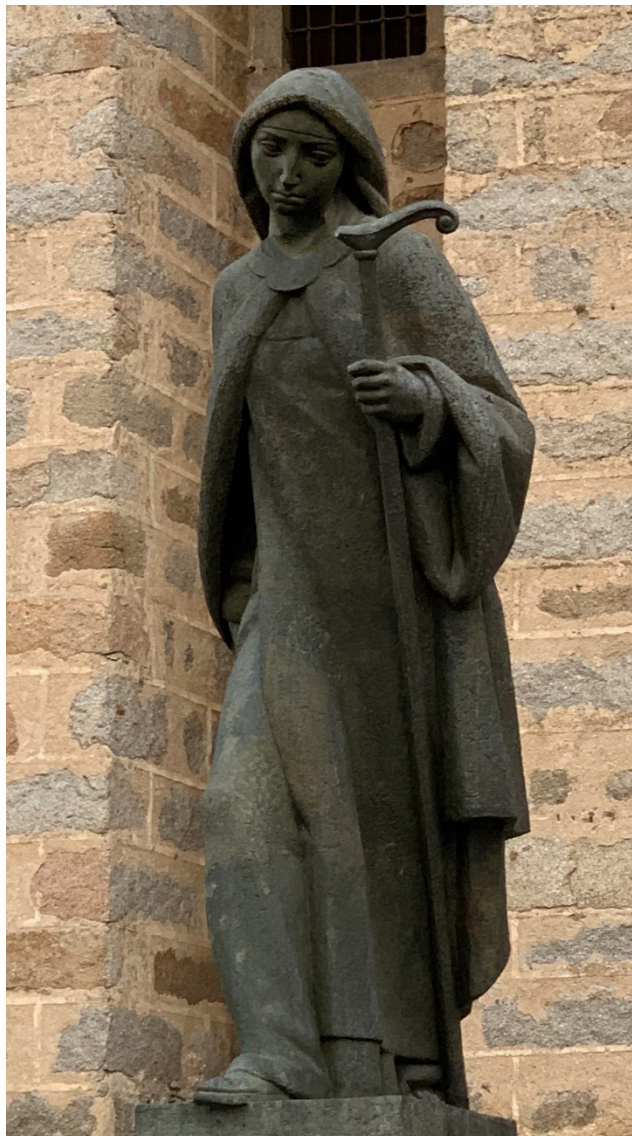
Teresa of Ávila setting out from the Monastery of La Encarnación to begin the reform of Carmel

Lo nuestro es no retroceder. Más bien, somos llamadas/os a emprender el viaje una vez más como lo hicieron nuestras antepasadas de IHM, yendo paso a paso y confiando en la Divina Providencia, en el amor mutuo y en nuestra llamada a abrazar el mundo.