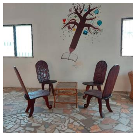
Wall mural and chairs