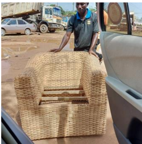
Handcrafted cane furniture