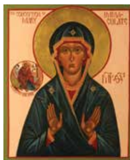
"The Immaculate Conception"

The Alphonsus Liguori Society was named for St. Alphonsus Liguori, founder of the Redemptorists, moral theologian and friend of the poor and abandoned. St. Alphonsus is also a patron saint of the IHM Sisters. The flame of spirit above his head symbolizes his anointing to "... bring glad tidings to the poor." LUKE 4:18 The IHM community is grateful to those benefactors giving $10,000 – $24,999. These donors exemplify the spirit of St. Alphonsus, who believed that each of us is called in love to give ourselves freely and generously to God and others.