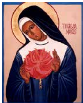
"The Holder of the Fire" ©1995 SSIHM

"I will give thanks to you, God, with all my heart; I will tell of your wonderful deeds." — PSALM 9:1