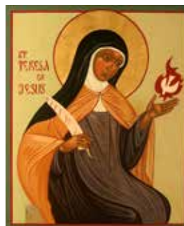
"St. Teresa of Jesus"