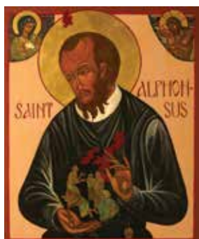
"St. Alphonsus of the Fiery Heart"

The Teresa of Avila Society was named for St. Teresa of Avila, mystic, reformer, Doctor of the Church and patron saint of the IHM Sisters. Her inner flame, received from the Holy Spirit, inspired her powerful writings about prayer and spiritual wisdom. The IHM community is grateful to those benefactors giving $25,000 – $39,999. These donors exemplify St. Teresa's belief that much can be done in life if one has the courage to attempt great things.