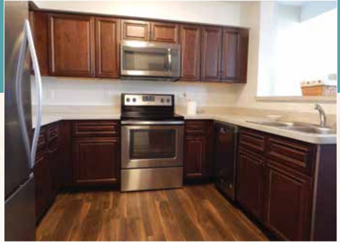
Interior views of model apartment

By design, IHM Senior Living Community offers meaningful connections through activities and outings in a caring, faith-based setting. The rich, natural landscape on the 108-acre campus provides attractive views and walking paths leading to native vegetation and wildlife; a spring-fed pond; an organic community garden; a contemplative labyrinth; and even an on-campus solar energy farm.