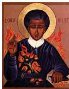
"Who Is Like Fire"