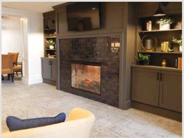
Bottom left clockwise – Bistro seating, game room, lounge, bistro bar, lounge/reading room