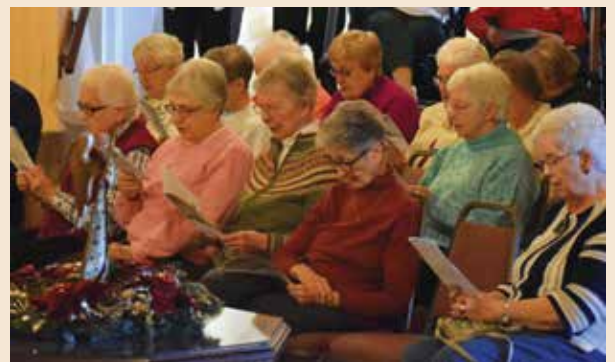
2019 blessing and lighting ceremony in the Motherhouse Foyer