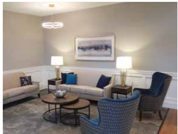
TOP: interior view of hallway; BOTTOM: entrance common seating area

"A scant six weeks have passed since I arrived and the first that greeted us was a lovely door sign. After waiting, adrift for so many months, it marked that we finally belonged . . . belonged to those who were already here their whole lives, to those who had come here to heal and grow stronger. We, who are new, will belong together learning the intricacies of life here, the growing pains of life together. A life wonderfully wound up in that of Our Creator . . . who inspires us to forgive graciously, to care about one another, to see the beauty in each person, each one of us. This new home that we have chosen is so attentive to details of comfort, I might even say it spoils me! Here is a place to save