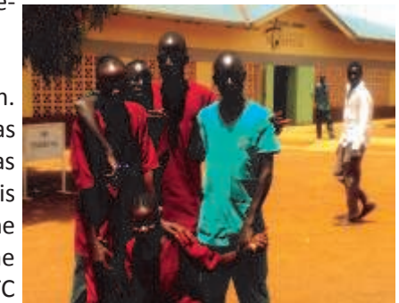
Nursing and Midwifery students at the Comboni Hospital in Wau.

Unfortunately, even our programs are not immune to the violence in South Sudan. The new Solidarity Teacher Training College at Malakal, dedicated in early 2013, has been totally looted and damaged, while the population of the town of 250,000 has been scattered to the four winds with many of its people brutally killed. Out of this violence however, the desire for unity and peace continues to grow. Thanks to the generosity of our donors, students from the Malakal Diocesan area (comprised of the three states most impacted by the civil unrest) will be accepted for studies at the TTC in Yambio. Students are also being accepted in Yambio and at the Catholic Health Training Center from the Nuba Mountains area of Sudan, which is the site of contin-