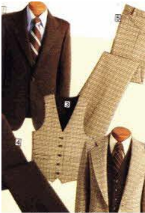
Mix and Match Co-Ordinnates

Men's clothing: coats $31.99, slacks and vest $13.99 each