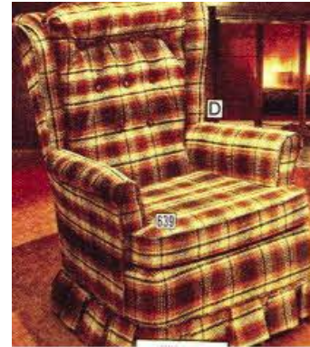
Colonial Styled Swivel Rocker