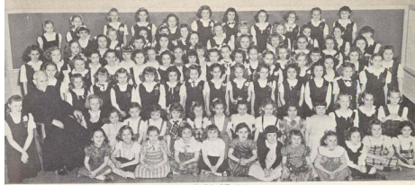
GIRLS REGISTERED AT ST. ANNE SCHOOL — FALL OF 1949